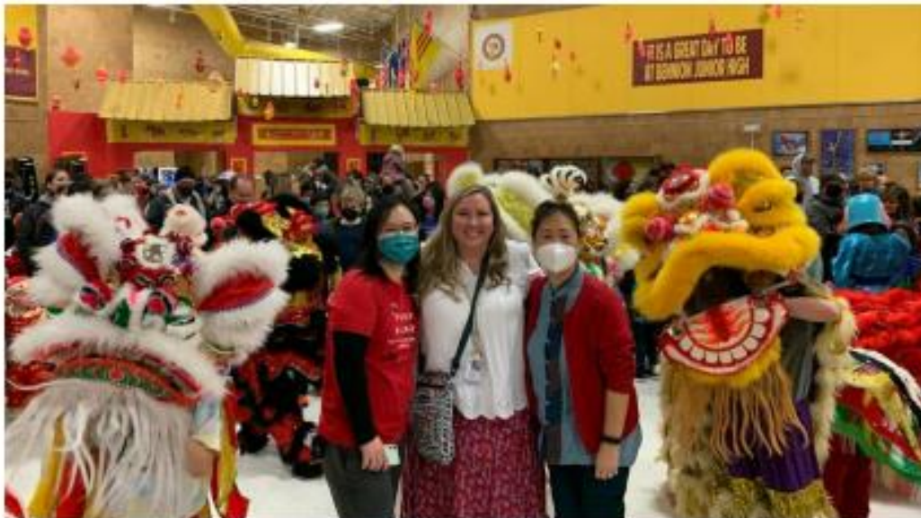
Utah PTA Engagement Award | Supplemental Material | Combined CNY Celebration Photos