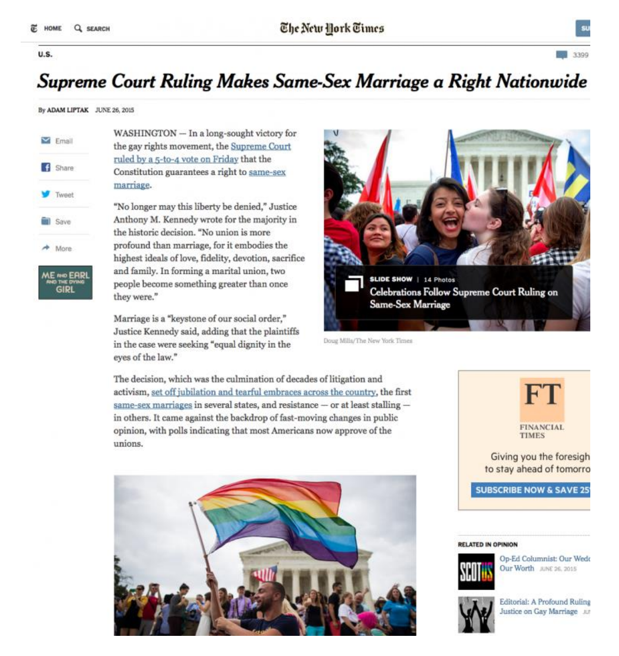
Figure S4. News clipping used as reflection stimulus in Study 4. Blue circles and ovals have been added to protect anonymity.

In the following, you will be randomly presented with a news article on a current social issue. Please spend some time to read the information. You will then respond to some questions regarding to the news.