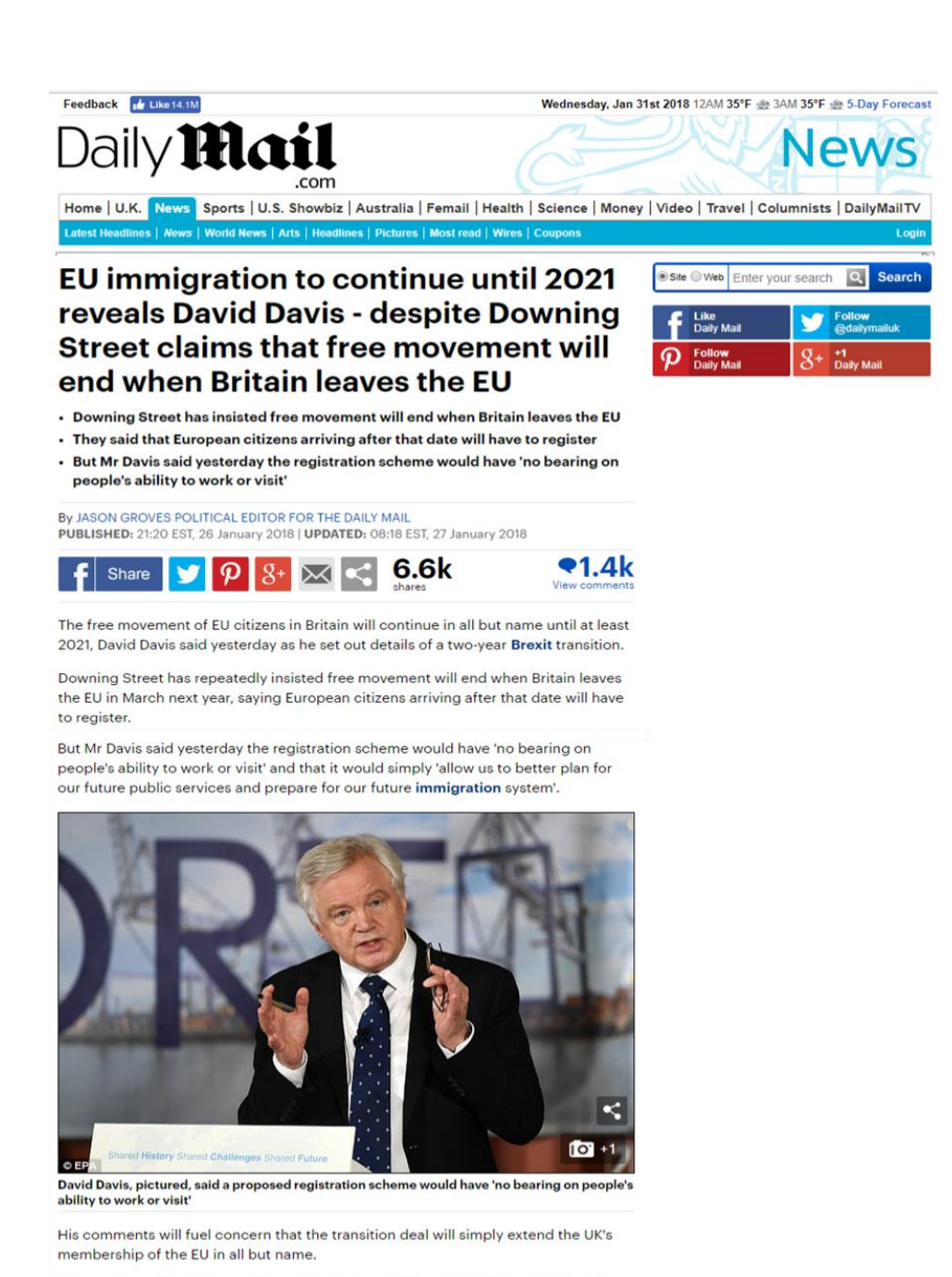
Figure S7. News clipping used as reflection stimulus in Study 6 for the UK sample.

The Brexit Secretary also confirmed that the UK will have to continue implementing new EU laws during the transition period, even though it will no longer have a say in